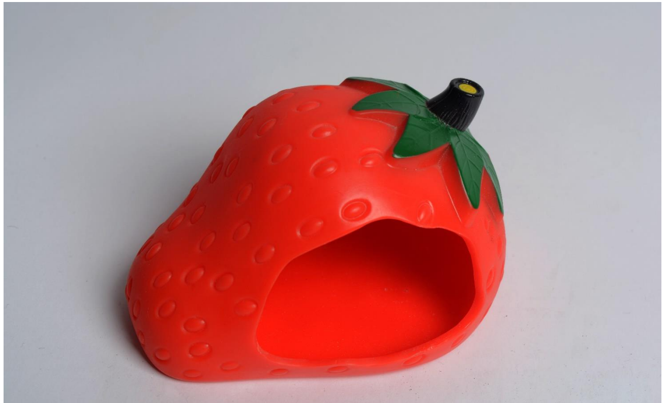
FIGURE 4- © HOLLIE ASKEW, 'BELONGINGS #4', INKJET PRINT, VARIOUS SIZES, 2022