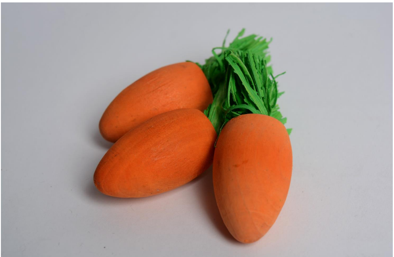
FIGURE 1 - © HOLLIE ASKEW, 'BELONGINGS #1', INKJET PRINT, VARIOUS SIZES, 2022