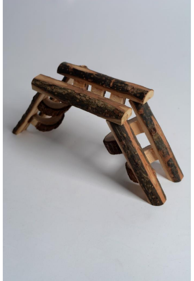
FIGURE 3- © HOLLIE ASKEW, 'BELONGINGS #3', INKJET PRINT, VARIOUS SIZES, 2022