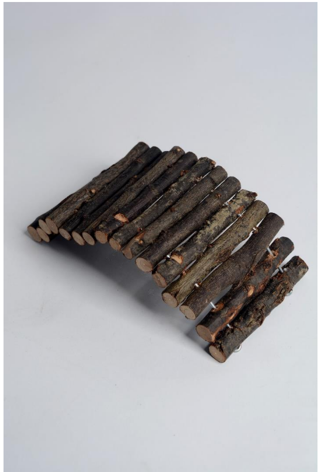
FIGURE 8- © HOLLIE ASKEW, 'BELONGINGS #8', INKJET PRINT, VARIOUS SIZES, 2022