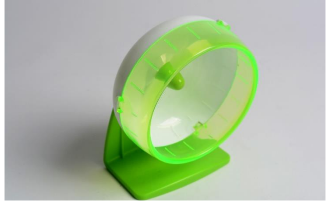
FIGURE 6- © HOLLIE ASKEW, 'BELONGINGS #6', INKJET PRINT, VARIOUS SIZES, 2022