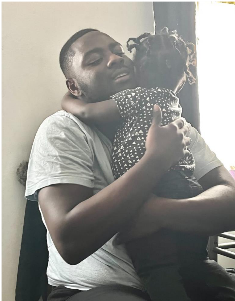
FIGURE 9- © YASMIN ROBINSON, COLLAGE #1, FROM ‘FAMILY PORTRAIT’ SERIES, INKJET PRINT, VARIOUS SIZES, 2022