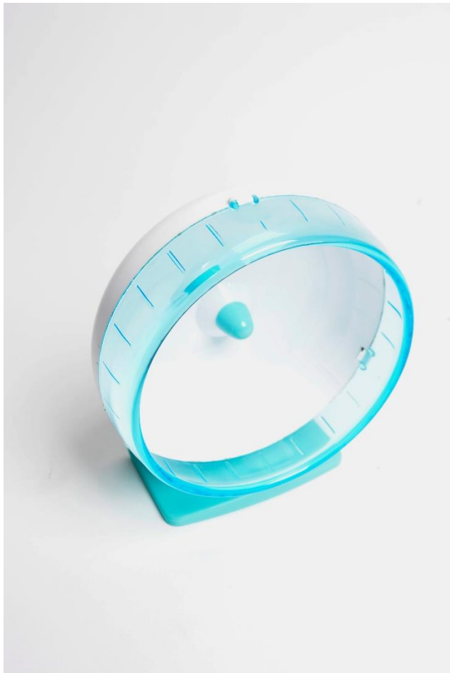
FIGURE 7- © HOLLIE ASKEW, 'BELONGINGS #7', INKJET PRINT, VARIOUS SIZES, 2022