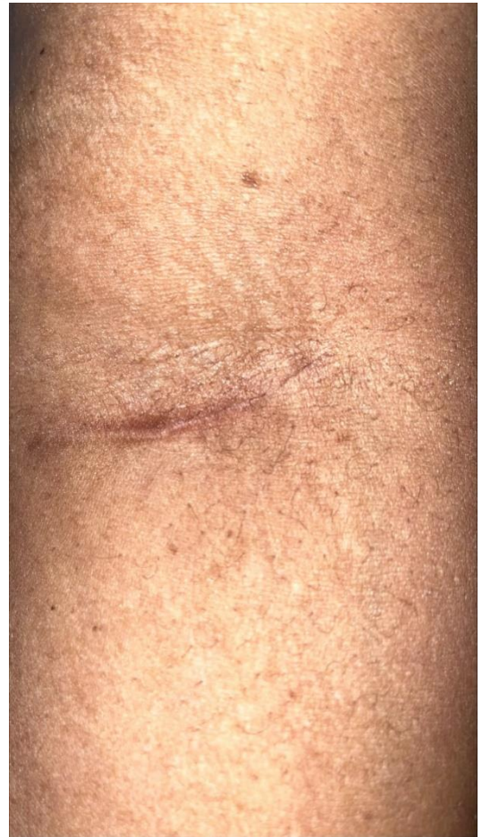
FIGURE 12- © YASMIN ROBINSON, 'SCAR' , FROM 'FAMILY PORTRAIT' SERIES, INKJET PRINT, VARIOUS SIZES, 2022

While in our first case study we have dealt with addressing the memory of something tangible (an animal companion) in this second case study we will look at the memory of 'something intangible' – more exactly: a family unit, a third entity, cumulative of emotions; events; moments, etc.