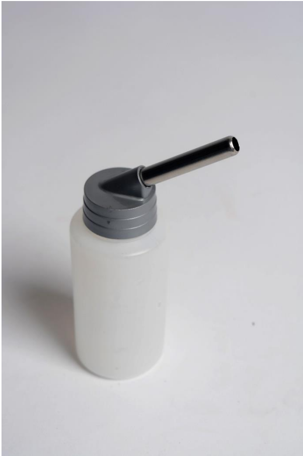
FIGURE 2 - © HOLLIE ASKEW, 'BELONGINGS #2', INKJET PRINT, VARIOUS SIZES, 2022