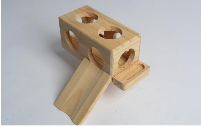
FIGURE 5- © HOLLIE ASKEW, 'BELONGINGS #5', INKJET PRINT, VARIOUS SIZES, 2022